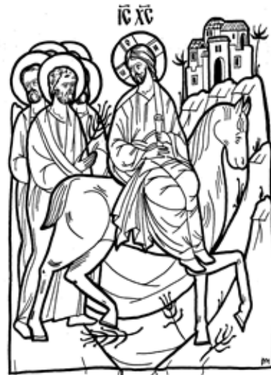
THE ENTRANCE INTO JERUSALEM

Some important Jewish people came up to Jesus and said: "Master, tell Your disciples to stop this noise." But Jesus answered them: "I tell you, if these