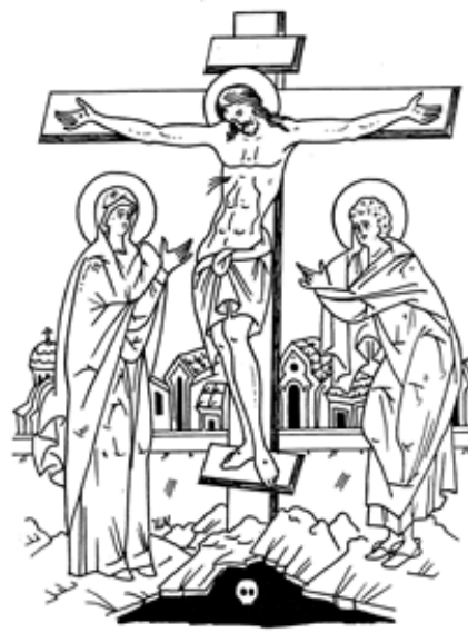
THE CRUCIFIXION OF OUR LORD

Then Jesus looked at His mother and His favorite disciple, John, who were standing at the foot of the cross. He said to His mother: "This will be your son." And He said to