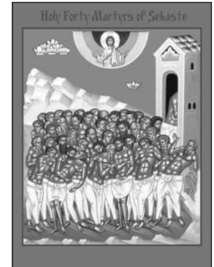
Holy Forty Martyrs of Sebaste