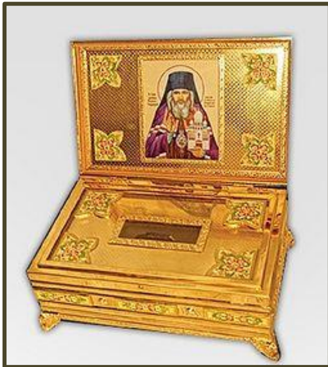
Relics of St John Maximovich