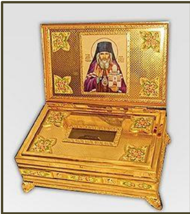
Relics of St John Maximovich