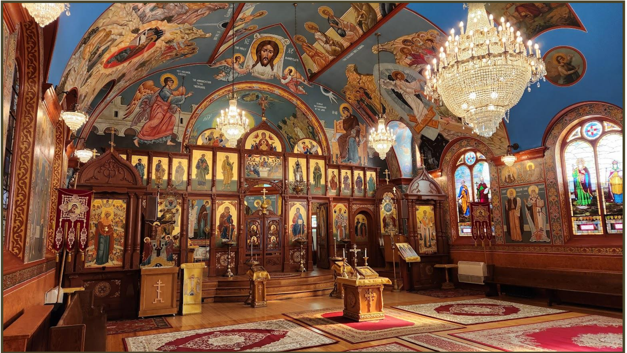
St. Nicholas Orthodox Church in McKees Rocks, PA