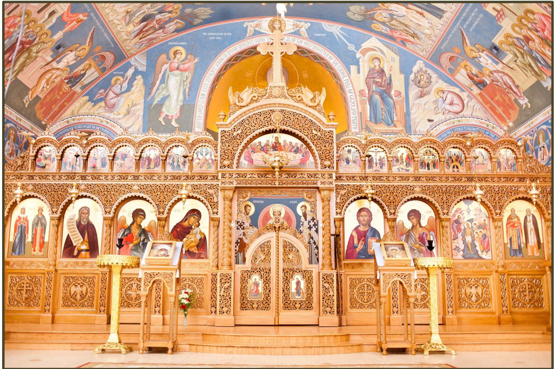
Christ the Saviour Cathedral, Miami