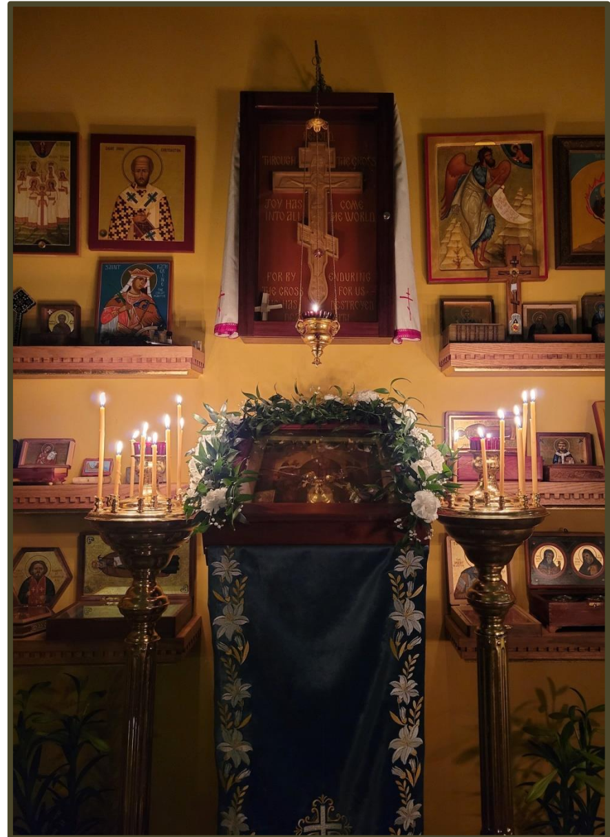
Holy Apostles Orthodox Church in Mechanicsburg, PA reliquary boxes